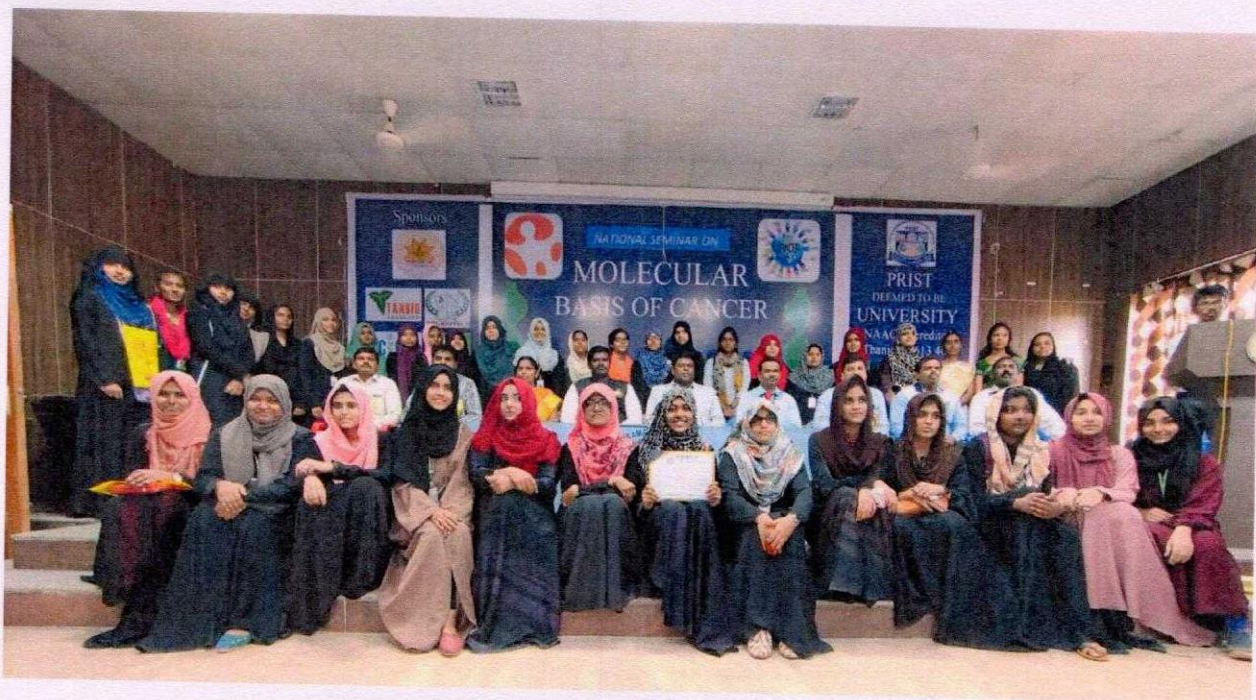
STUDENTS PARTICIPATS IN THE SEMINAR